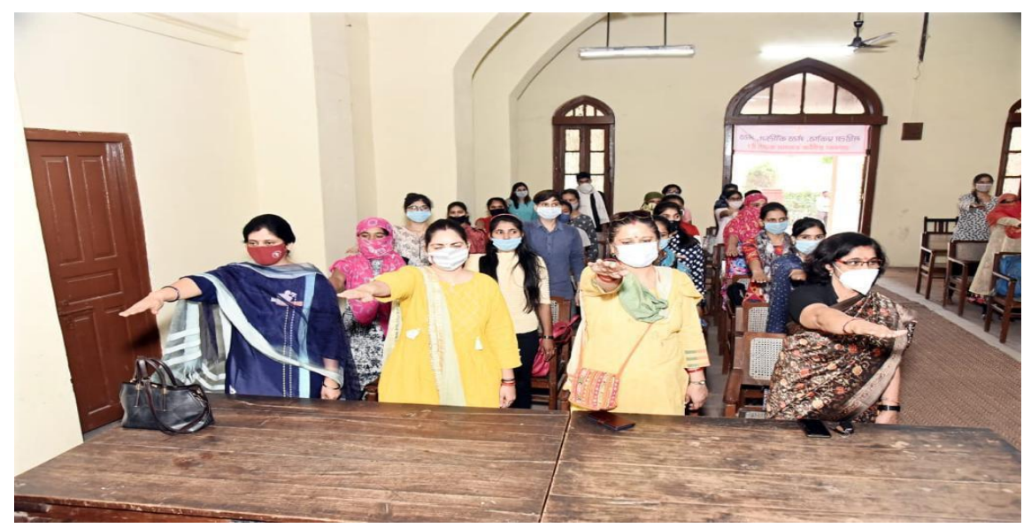
Girl students and teachers taking pledge for parity