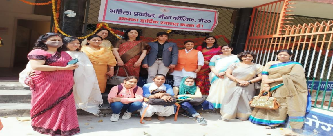
Women's Day Programme

Besides the activities mentioned, counselling, interactive and feedback sessions on multiple topical topics were conducted for the girl students on weekly basis throughout the year. The Girls' Common Room in Swarn Jayanti Bhawan is a facility established for all girl students to convene, engage, and collaborate on matters of importance. It is a well-ventilated facility (equipped with a separate washroom) and provides access to newspaper publications, notice board and other resources offered by the Woman Cell. All the important notices related to co-curricular activities, cell resources and activities are posted here. The facility has a complaint box to report any wrongdoings, and a sanitary napkin vending machine and incinerator is also installed to ensure the health and wellness of the girl students.